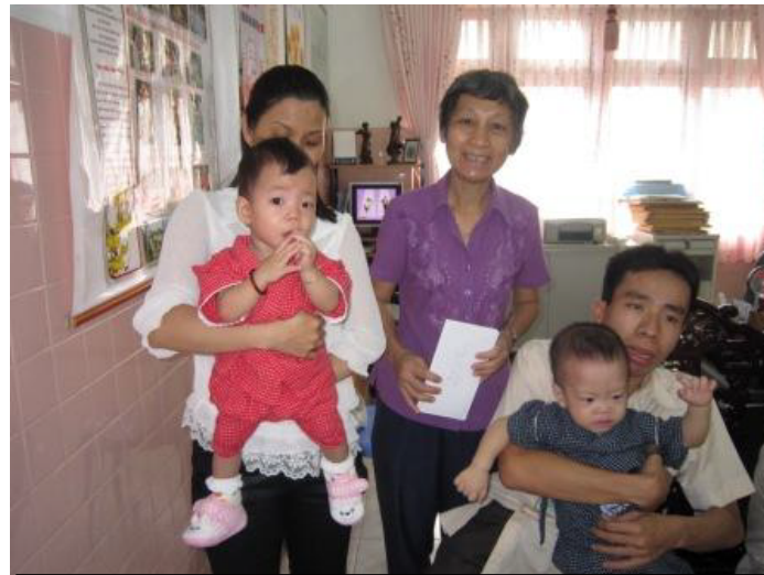
HELLO ALL, WE ARE NOW ONE.

After the show it was time to meet up with friends last seen at the previous event. Last years show raised £11,500 for the charities.